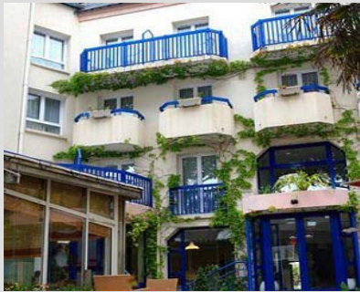
Hotel Celtique Carnac