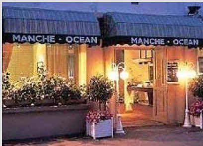
Hotel Manche Ocean Vannes