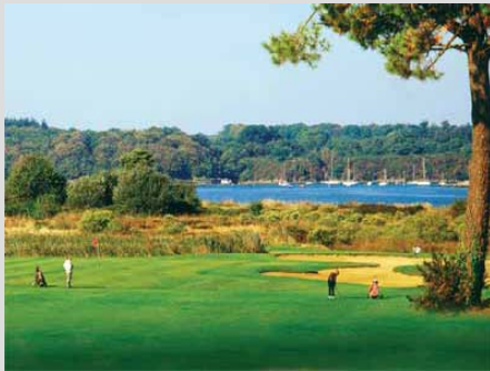
Golf de Baden