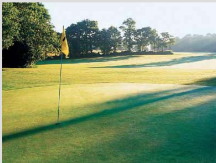
Golf de L'Odet