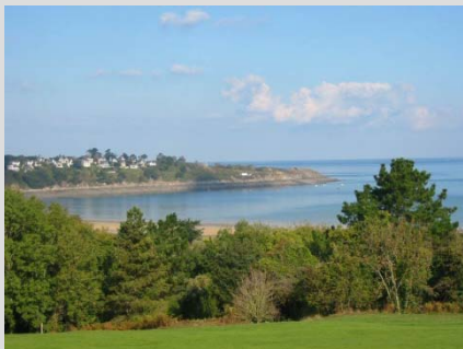
Golf de St Cast Pen Guen