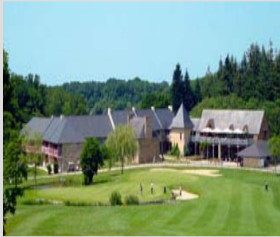
La Priere at Le Tronchet Golf