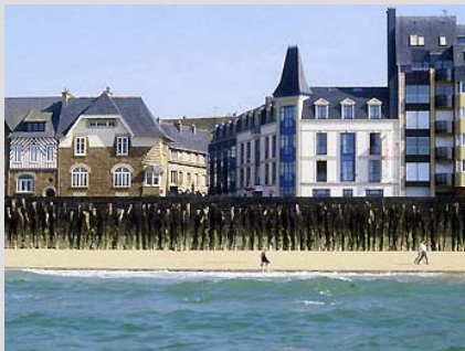
Hotel Mercure St Malo