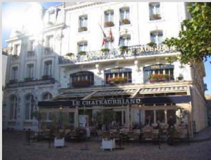
Hotel France et Chateaubriand