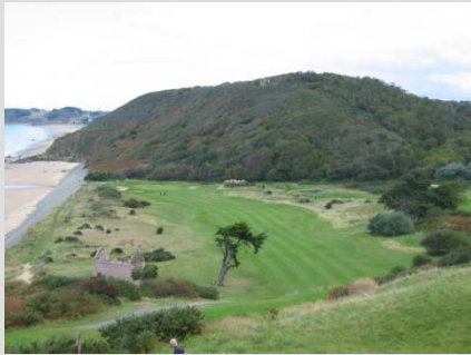
Pleneuf val Andre